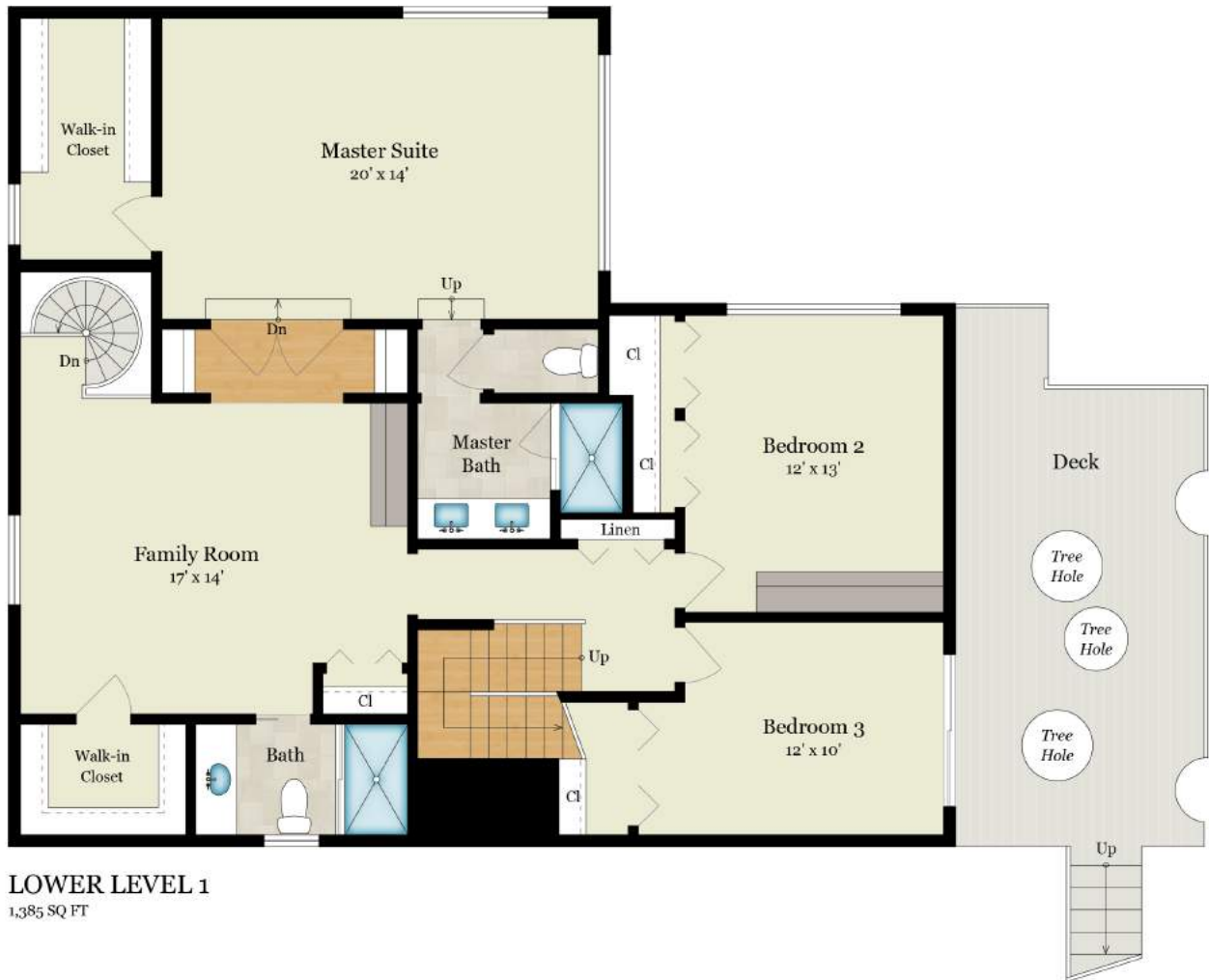
LOWER LEVEL 1 1,385 SQ FT