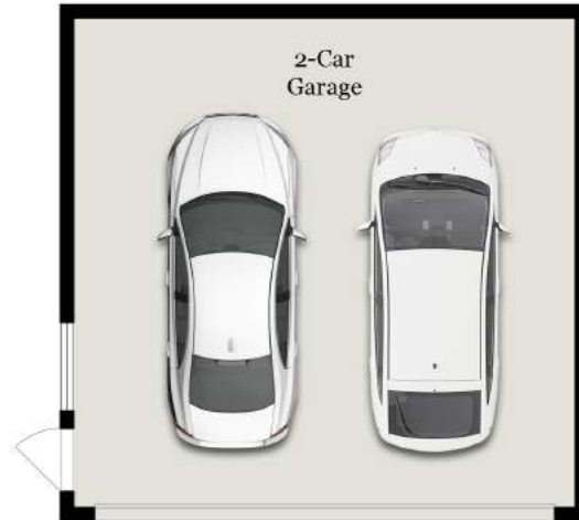
DETACHED GARAGE 420 SQ FT